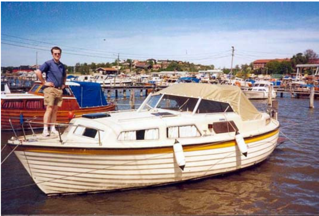
On the deck of my boat in the Oslo Fjord.

Apart from people, technology, business, and life coaching, my personal interests are boating, skiing, dogs, classical history, architecture and fine art. So if you want to invite me for boating, skiing or the enjoyment of some fresh air, feel free to send a note. I majored in business and economics at Lund University of Sweden and studied at University of California at Berkeley and at Oslo University.